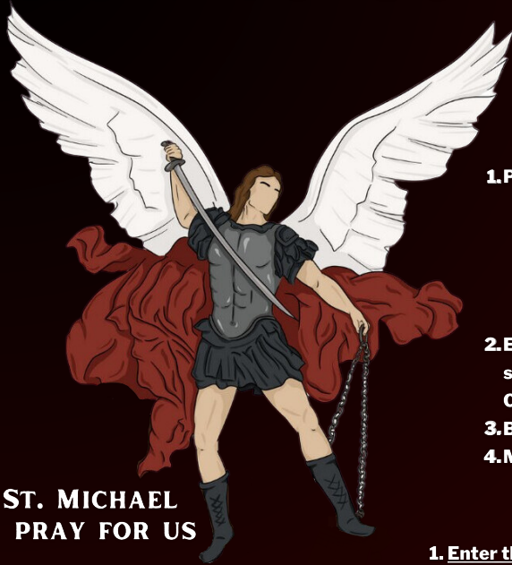
ST. MICHAEL PRAY FOR US