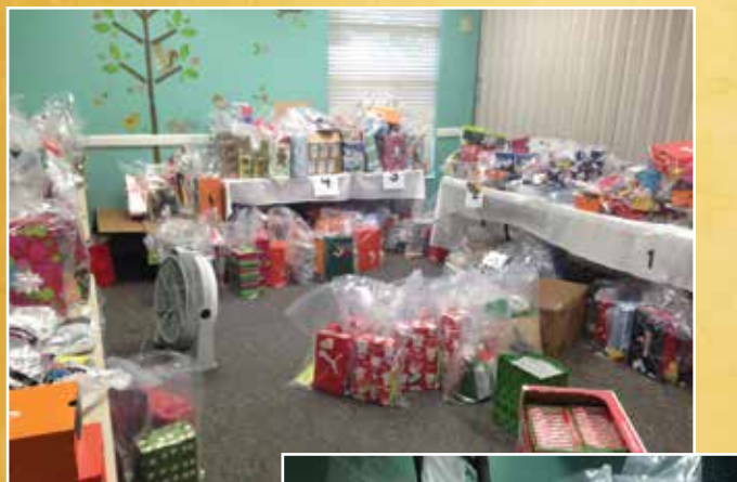
A small collection of sneakers and socks from the Ladies of Charity Christmas Sneaker and Sock Drive, which ended December 15.