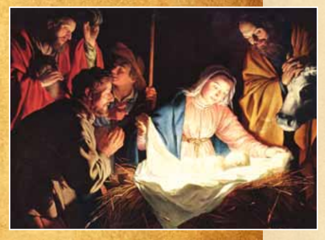
Image: The Adoration of the Shepherds /Gerard van Honthorst

hristmas is a beautiful time of wonderment for children and memories for adults. The passage of time and space becomes transparent in the seamless garment of the swaddling clothes that covered Jesus in the manger at Bethlehem. The scene of the Nativity calls to mind thoughts of Christmases gone by and evokes a sense of security and peace within us. We remember a Savior has been born to us today — Jesus Christ the Lord. The first Christmas witnessed the birth of a shining star, the shepherds' awe and wonder, the choirs