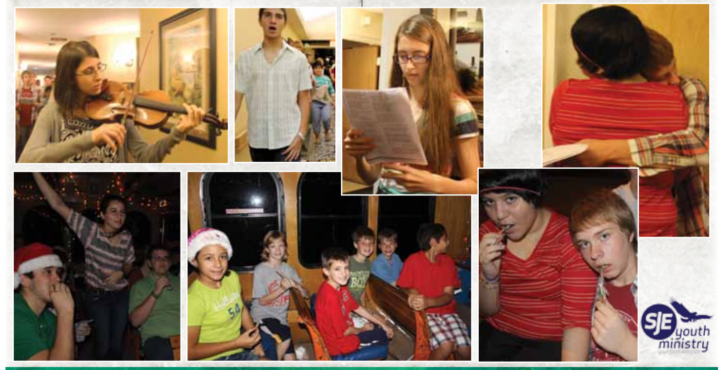
High School Youth meets from 6:00 to 8:00 p.m. in the ballroom Middle School Youth meets from 5:30 to 7:00 p.m. in the Claussen Center Seminar Room