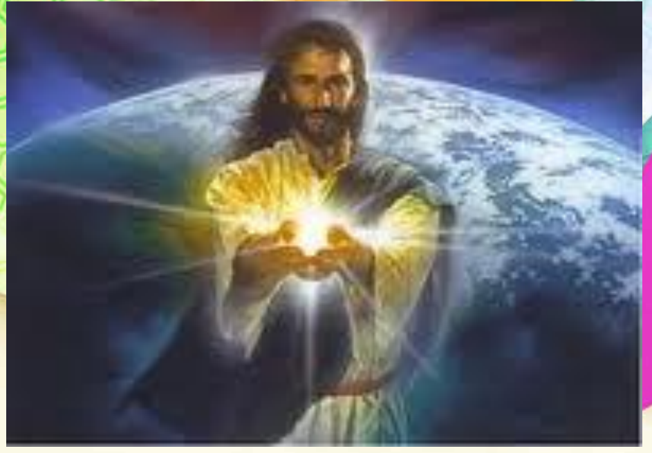
Your Light Must Shine Before Others