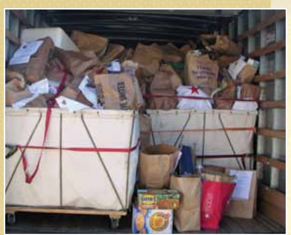
At the November St. Vincent de Paul food drive, St. John parishioners donated essential food items to fill a 1 ½ ton truck from floor to ceiling, roughly $50,000 worth of food, to help out those in need.

God's poor in countries that are devastated by famine, rebellion and oppressive governments. People are challenged in many ways to extend their love in the areas of society where love is yet to be born!