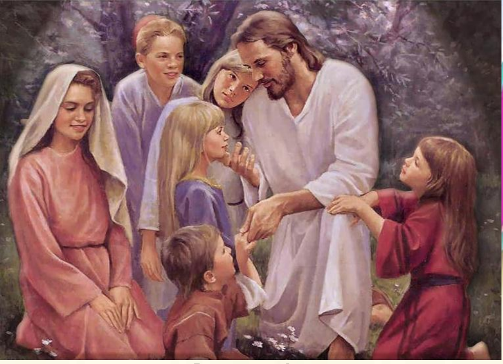
Love one another