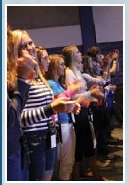
The teens clap for the live rock band.