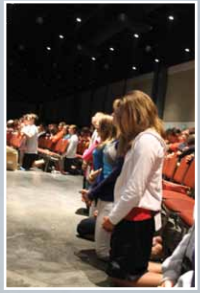
Teens attended Mass and at least an hour of Adoration every day.