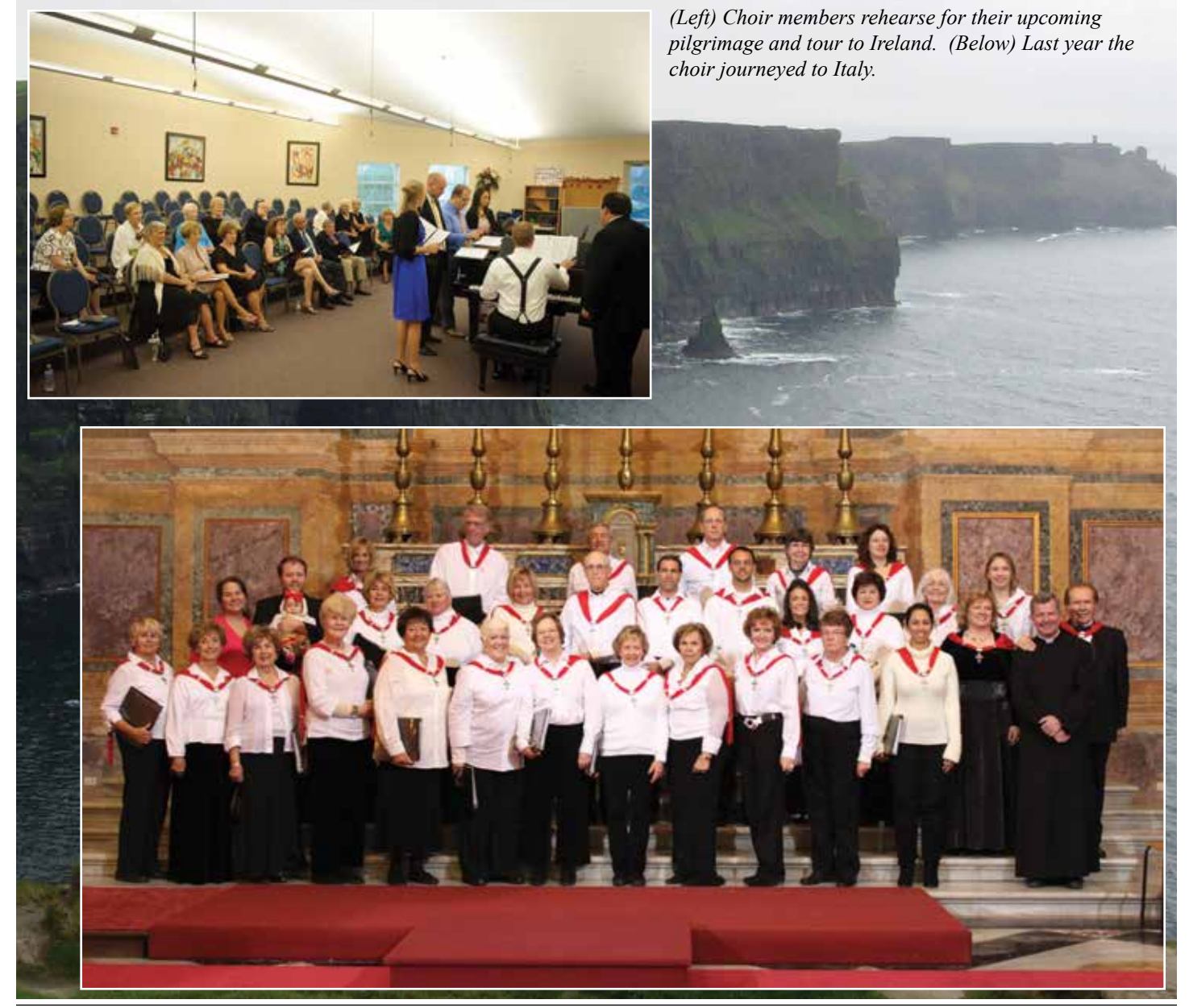
JULY 13, 2014 ~ FIFTEENTH SUNDAY IN ORDINARY TIMES