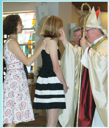
(Above and Below): Standing behind each candidate, sponsors present the candidates to the Bishop. Their prayers and support are important as they lead by example, as a true witness of Christ.