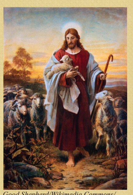
Good Shepherd/Wikimedia Commons/ Bernhard Plockhorst