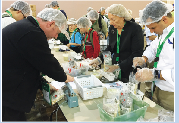
Putting together Meals Ready to Eat