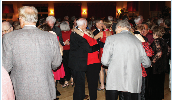
Over 300 people attended the Knights of Columbus Valentine Dinner Dance on February 11 held in our Ballroom.