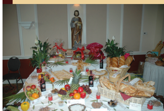
Breads and Altar Offerings/Blessing "la tavola di San Giuse"