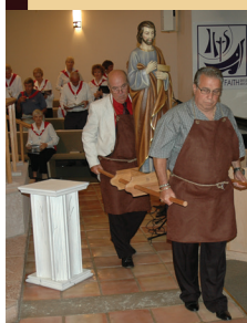
Procession to PLC