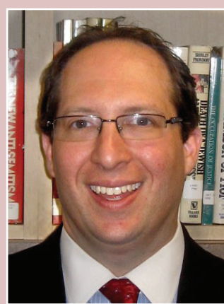
Event open to men!