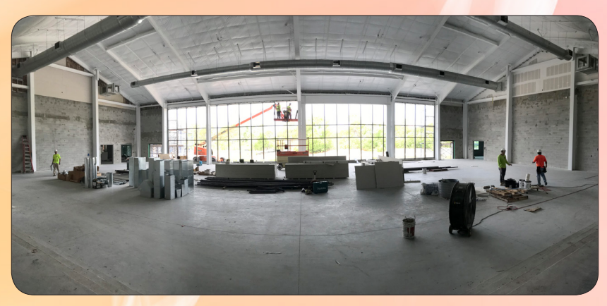
A view from the stage of the Pulte Family Life Center, which will house unique programs and activities to invigorate our Parish Family and the entire community.

http://w2.vatican.va/content/francesco/en/homilies/2018/documents/papa-francesco_20180520_omelia-pentecoste.html